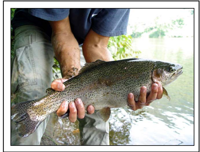
Youghiogheny CRTU Rainbow